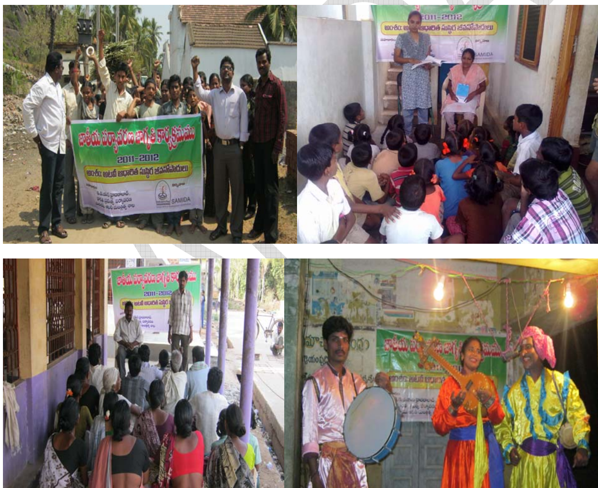
Village level awareness programs for the National Environmental Awareness camps and rally and Kala Jata programs in the target Villages.

Environment protection and National Environment Awareness Campaign program (NEAC) 2011-2012. The theme was Forests base Sustainable Livelihoods to hike the ecological levels in this area. In addition to that, the deforestation activities suffered the people for walks miles together to collect palm leaves for constructing shelters traditionally, hill grass and fodder for feeding purposes for milch Cattle's, goats, sheep's even. The community main occupation has become milk procurement and selling in the local dairy, market and hotels etc per Rs. 30/- liter now a days, the feeding has become more costlier and so the farmer's are not feeling comfort for milk procurement and selling in the local markets are not profitable to the farmer's and most of them are gave up the profession and settle as wage employees in local or migrating to other places for earning, which ever employment they may secure there. In the program SAMIDA was conducted the 20 village level awareness programs and rally was conducted in the target area. And also we are conducted the filling activities in the target area. The funds was supported by the Deccan Development Society and Minister of Environment –Forest Govt of Indi.